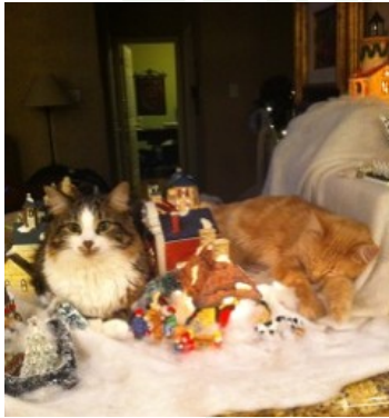
Odin and Bo in Kittyville